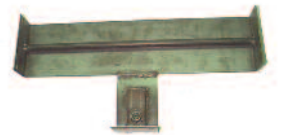
TOF-20A: lock plate