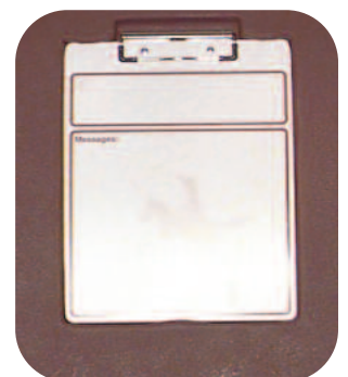
TOF: wet erase board