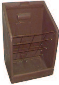
TOF-T: feeder body