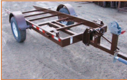
Hydraulic Transport Kit