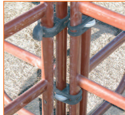
3 for 4-way connection