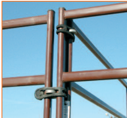
2 for 3-way connection