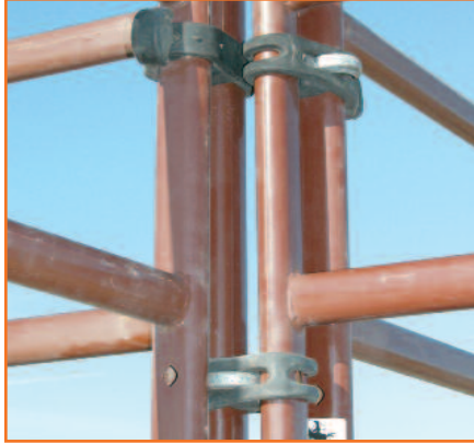
3 for 4-way connection