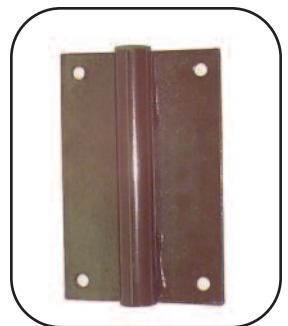
FLF-40W: lock hook plate