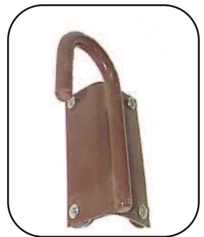
FLF-30RW: right hook