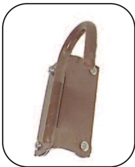
FLF-30LW: left hook