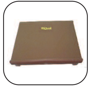
FLF-L: feeder lid