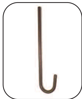
FLF-32: lock hook