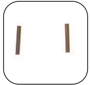
9FLF-1: hinge tubes